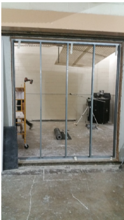
Figure 2 – Framing members installed