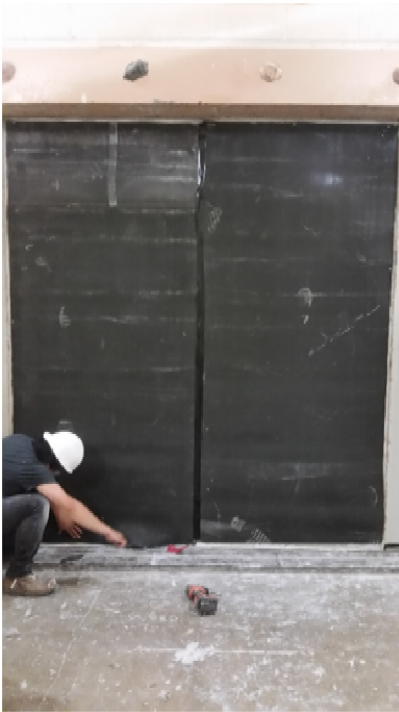
Figure 3 – Wall Blokker layer installed