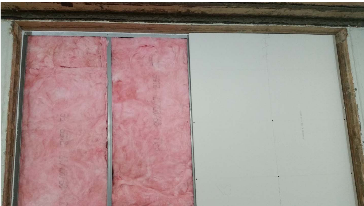
Figure 4 – Stud cavity insulation installed, receive side gypsum board partially installed