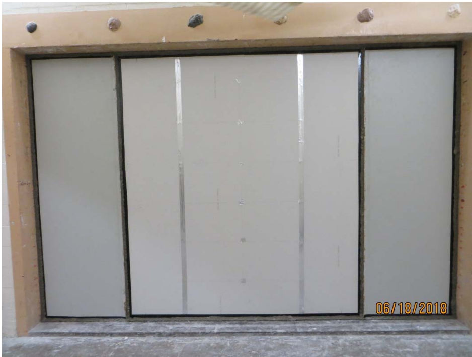
Figure 1 – Completed specimen mounted in test opening, as viewed from source room