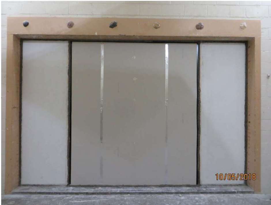
Figure 1 – Specimen mounted in test opening, as viewed from source room