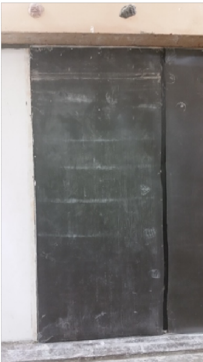
Figure 4 – Mass loaded vinyl layer installed