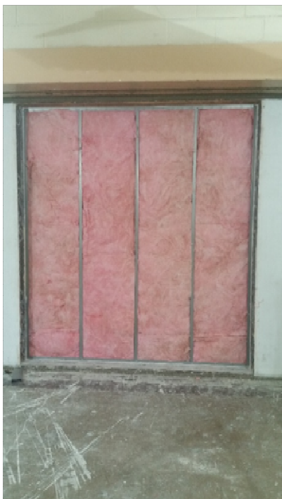
Figure 2 – Framing members and cavity insulation installed