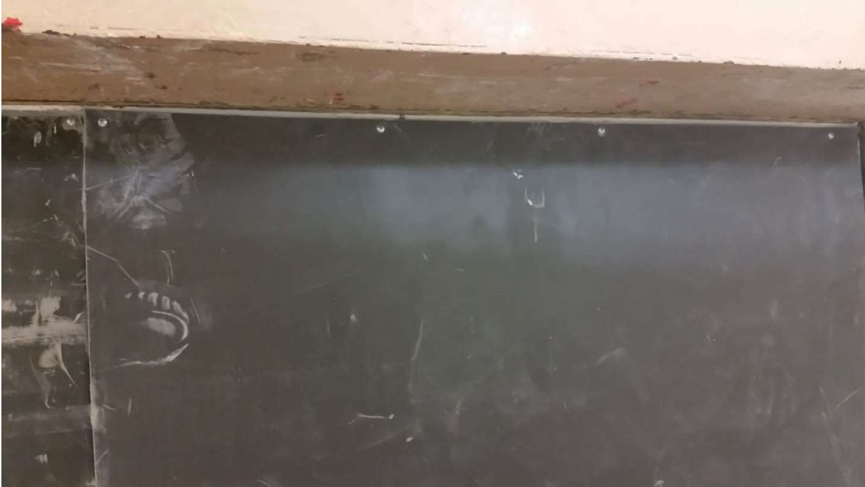
Figure 3 – Screw spacing at top of mass loaded vinyl layer